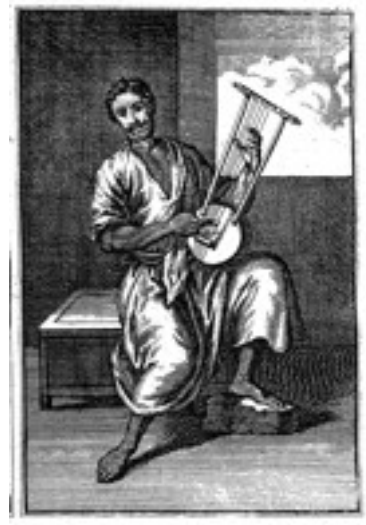
Plates 1 and 2. A Jew and a Moor from Corneille le Bruyn's Voyage to the Levant (1702) with representative instruments (158, 192).

While these travelers were certainly committed and attentive, their methods were makeshift and idiosyncratic—especially when it came to describing music. In a cosmopolitan land of Arabs, Turks, Moors, Muslims, Christians, and Jews, travelogue commentary on music ranged from offhand observations to full chapters on the music of the natives. In the former category, consider the above plates of a Jew and a Moor from Corneille le Bruyn's Voyage to the Levant . Of the first plate, le Bruyn writes: