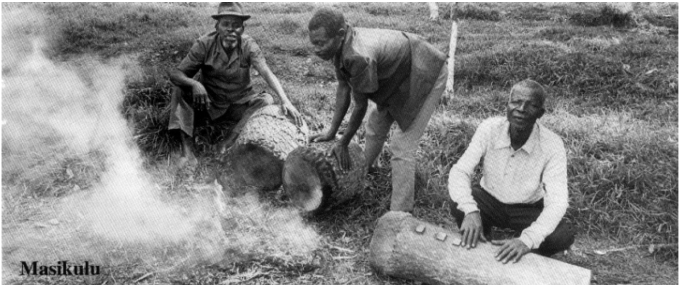
Figure 8: Masikulu drums. from the liner notes of Anthologie de la musique congolaise (RDC), Vol. 7. Musique des Kongo-Mbata (2006). 1974.