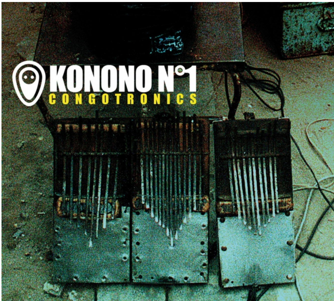
Figure 1: The cover of Congotronics by Konono No 1 (2005) features photographs by the album's producer Vincent Kenis, design by Zoran Janjetov, and art direction by Hanna Gorjaczowska.