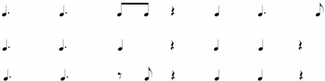
Figure 3: Related clave patterns common to various Congolese, Afro-Cuban, and West African musical genres.

For the moment, it is worth emphasizing that Freivogel's comments frame Konono's music as an archetypal expression of Congolese musical forms and aesthetics in a historicized, transatlantic context. It is significant that Freivogel places the band's "improvised electronics" at the margins of his analysis, an approach that I will return to shortly.