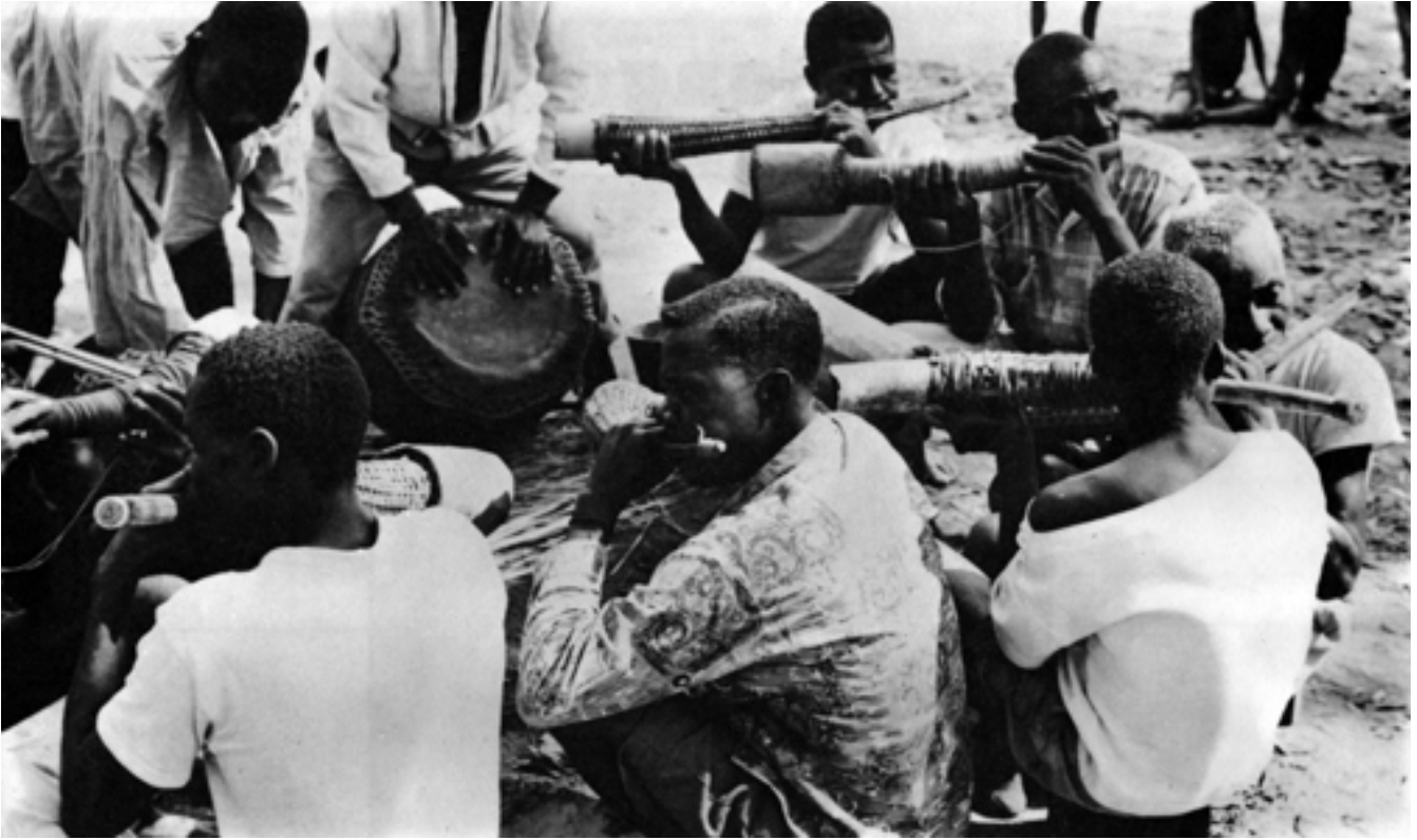
Figure 7: "Trompes et timbales de Mandombé" (Horns and drums from Mandombé). Bakongo masikulu musicians. Photo by Charles Duvelle from the liner notes to Congo: Musique Kongo: Ba Bembé, Ba-Congo, Ba-Congo-Nséké, Ba-Lari (1967). September 5, 1966.