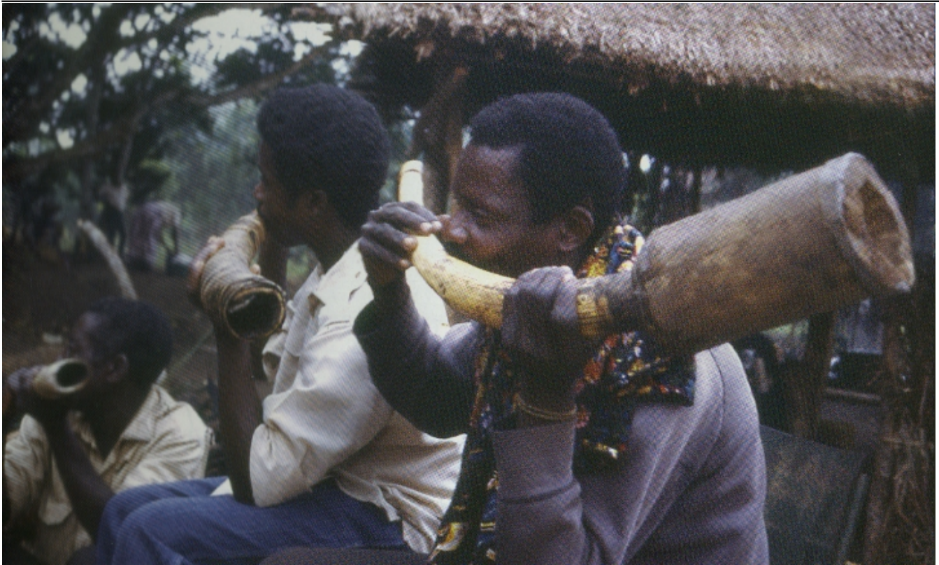
Figure 9: Mpungi horns in masakulu ensemble.