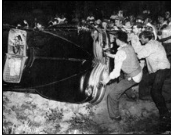
Figures 1 and 2: 1949 benefit concert for the Civil Rights Congress in Peekskill, NY, and the ensuing riots.

In the weeks following the Peekskill riots, Guthrie wrote some of the angriest, most defiant songs of his career, railing against the bigotry of his assailants. His song “Peekskill Golfing Grounds” vividly recalls the violence of their rhetoric: