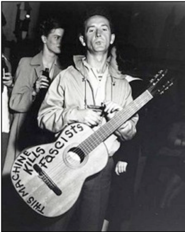
Figure 3: Guthrie's guitar was an ally in his political fight.