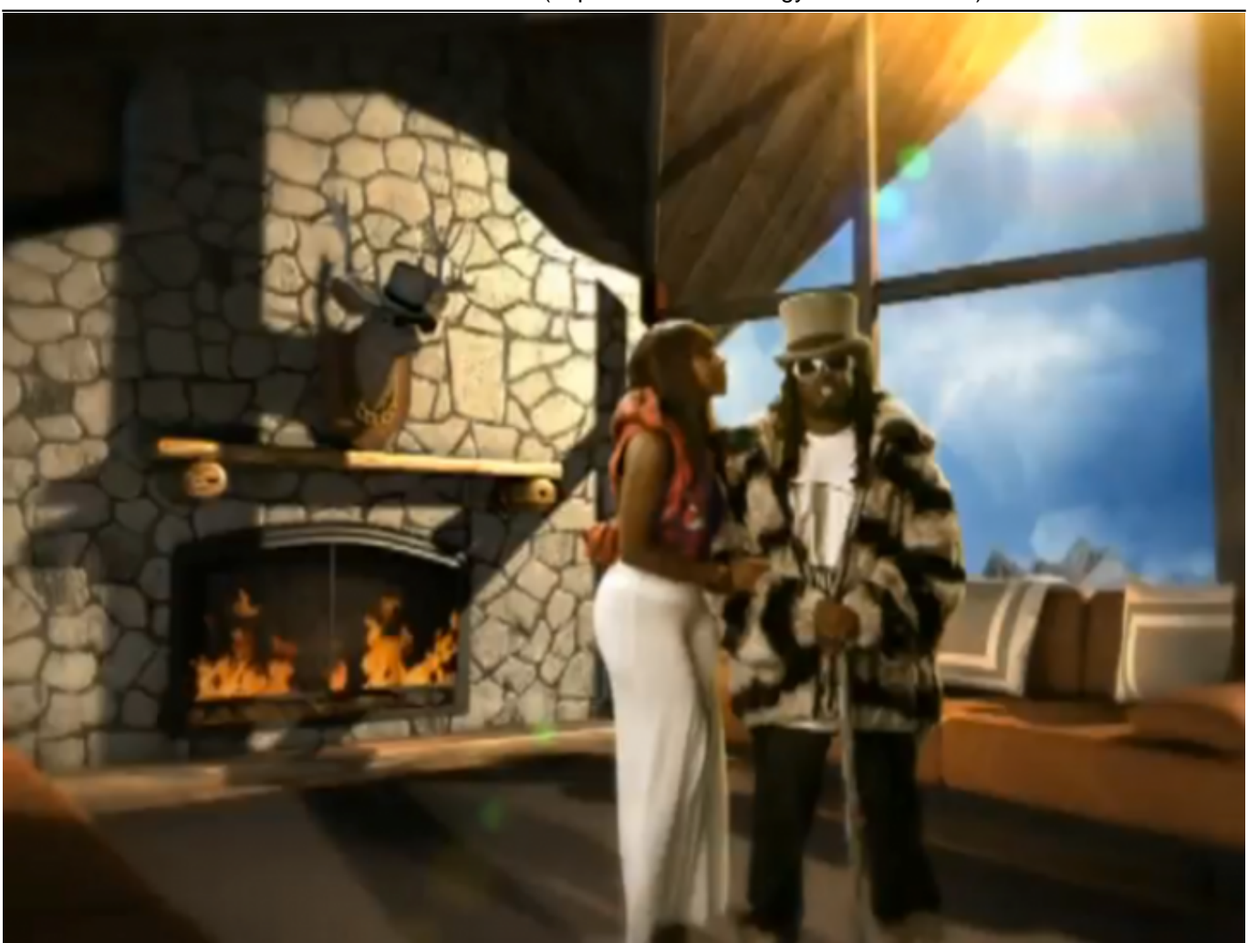
Figure 3. T-Pain with love interest in log cabin in Aspen

Published on Ethnomusicology Review (https://ethnomusicologyreview.ucla.edu)