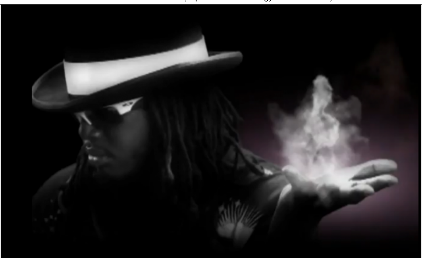
Image 1. T-Pain opening conjuring scene in music video "Cant Believe It"

Published on Ethnomusicology Review (https://ethnomusicologyreview.ucla.edu)