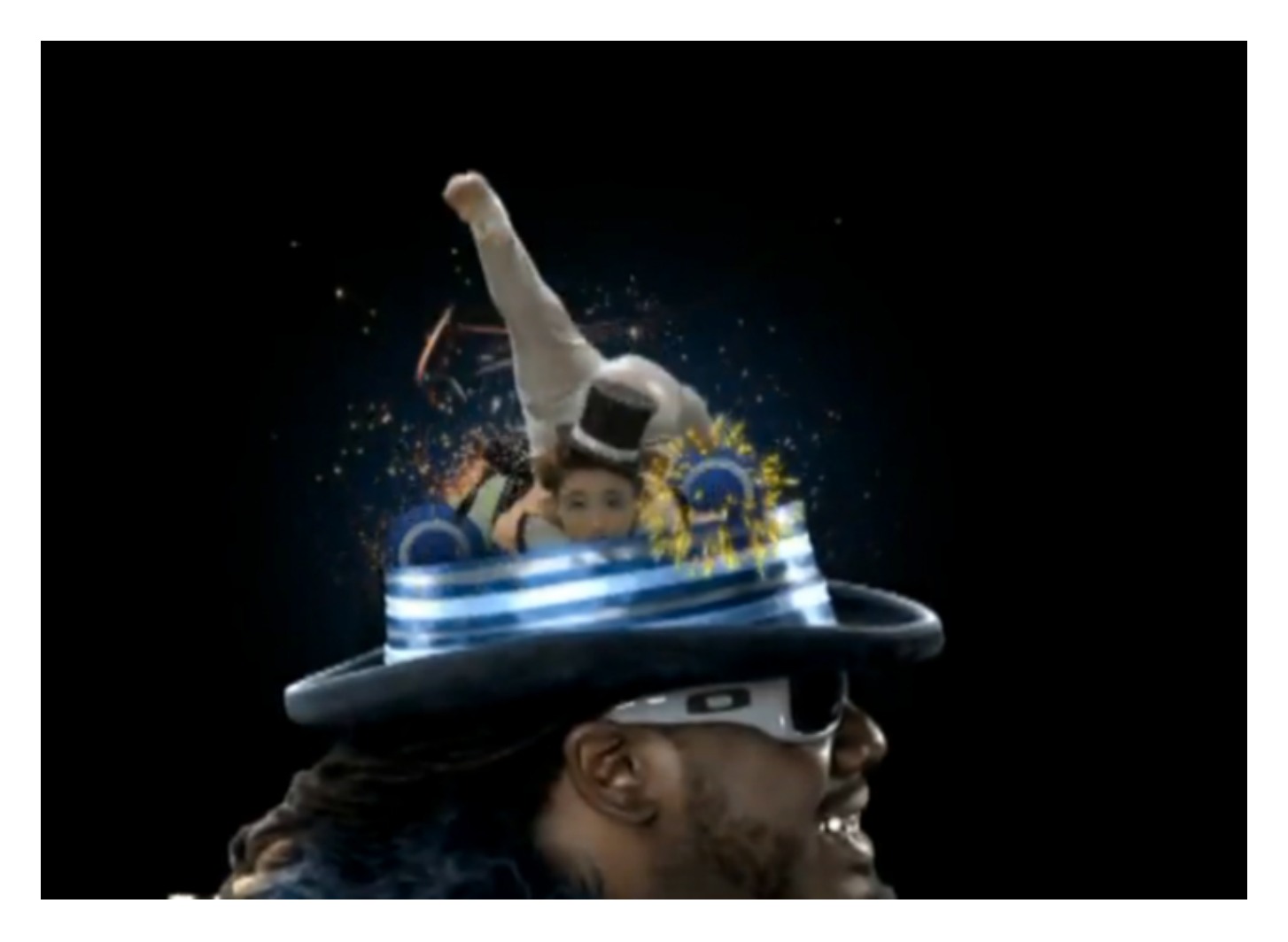
Figure 5. T-Pain with blue top hat as portal

Published on Ethnomusicology Review (https://ethnomusicologyreview.ucla.edu)