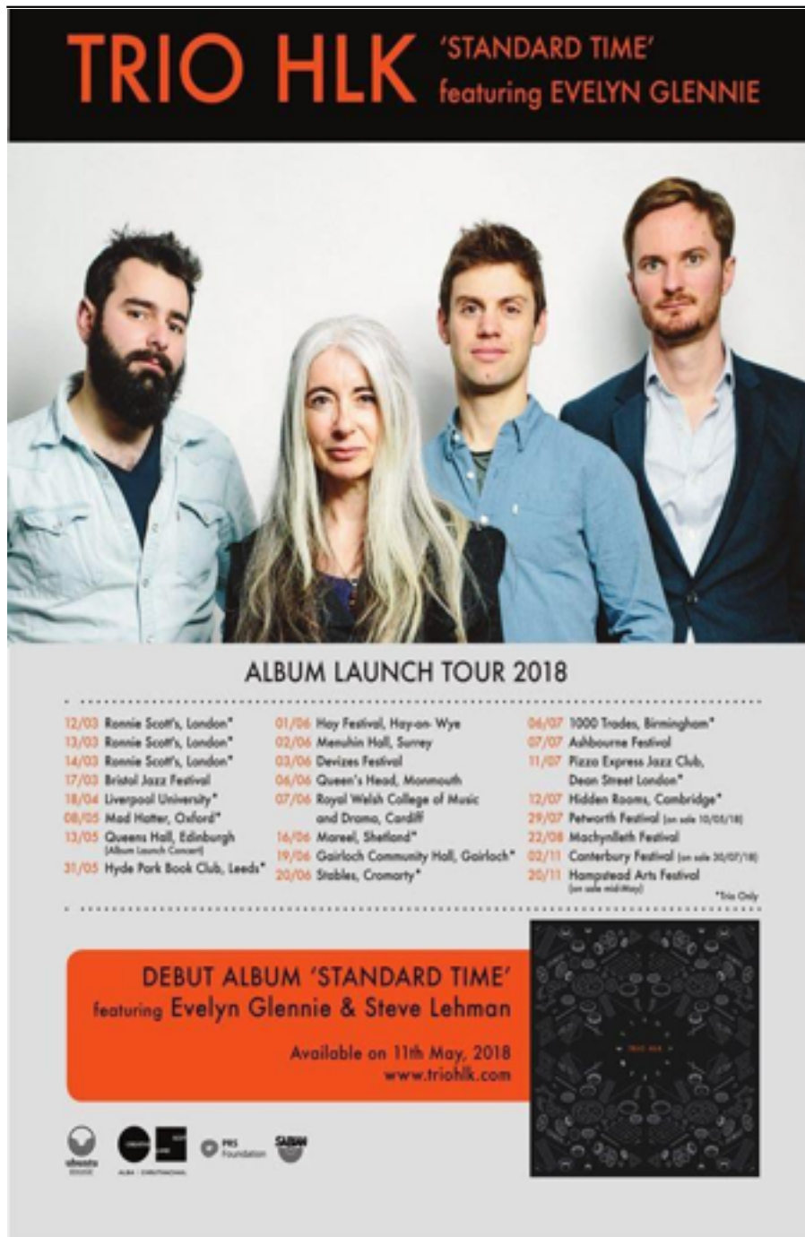
Figure 1. Album Launch Tour Dates (Source: Trio HLK Facebook page, March 24, 2018).